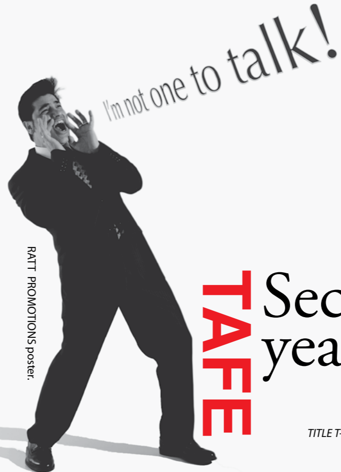
RATT PROMOTIONS poster.