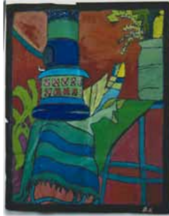
Colourful life 594 x 420 mm acrylic on TV board 1989

A new school, and new outlook on life, this was the year that everything would turn around for me.