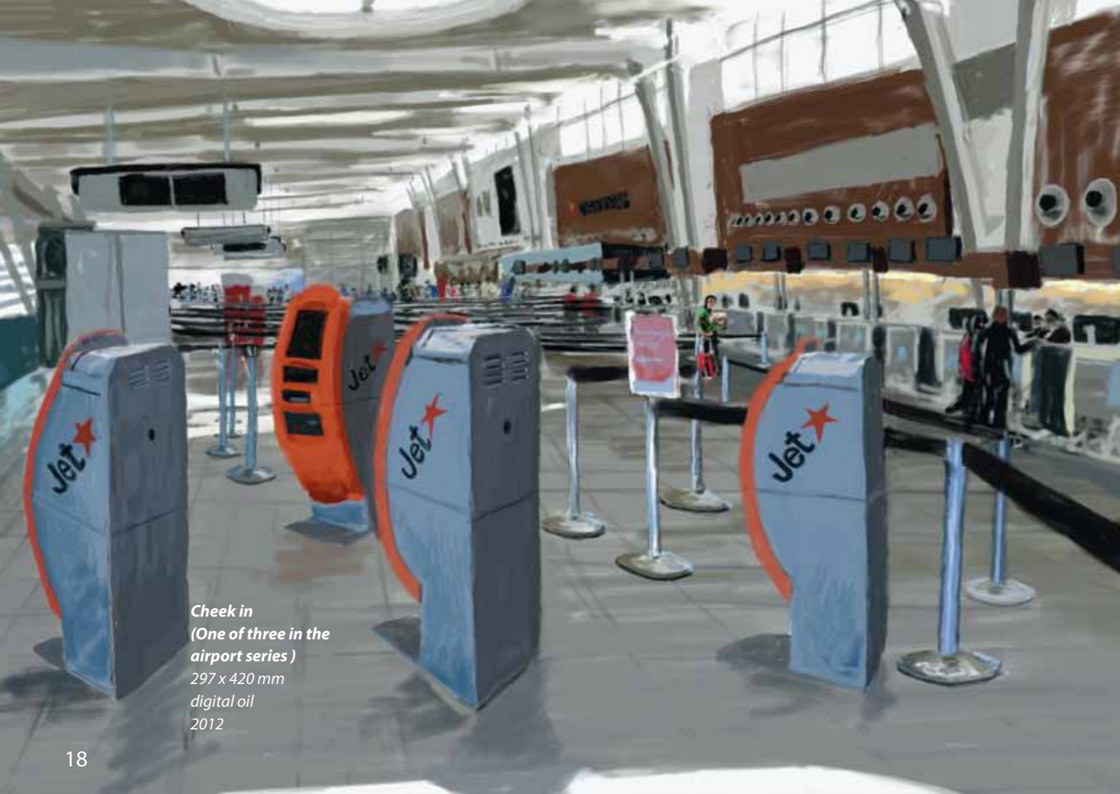
Check in (One of three in the airport series ) 297 x 420 mm digital oil 2012