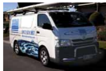
Typo assignments Wayne Thompson two page spread.