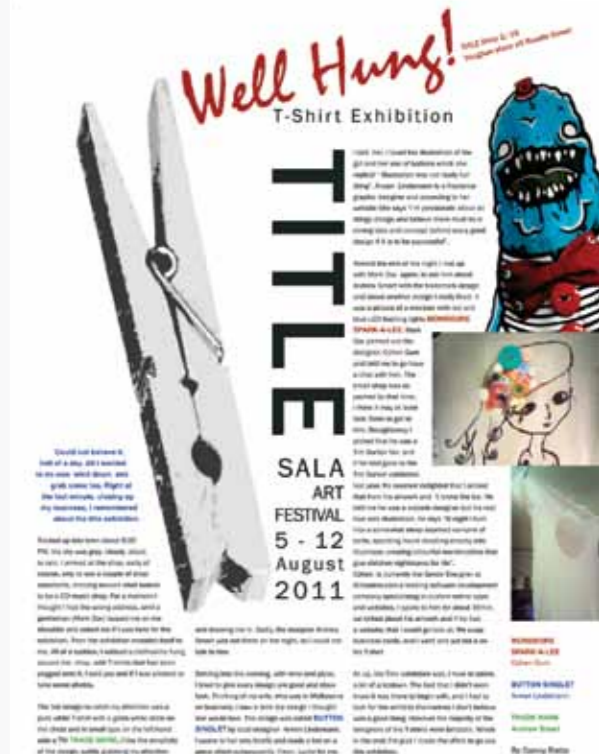
Typo assignments one page spread TITLE T-shirt exhibition write-up